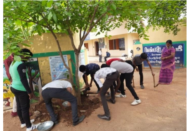
Snapshot of Swachh Awareness Campaign Snapshot of School Campus Cleaning