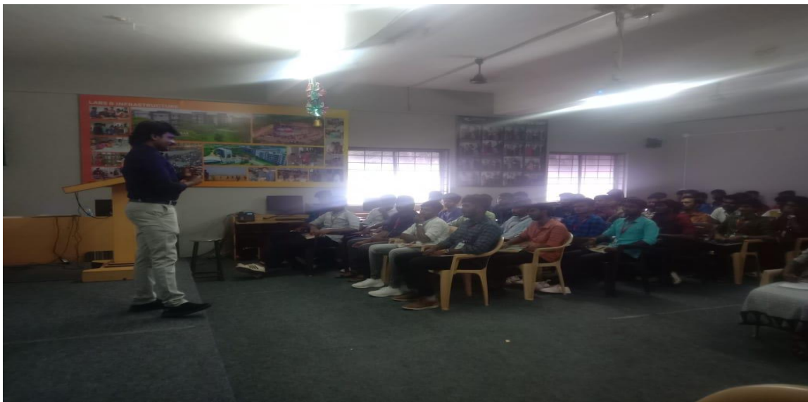
Resource person sharing about technologies used in software development models