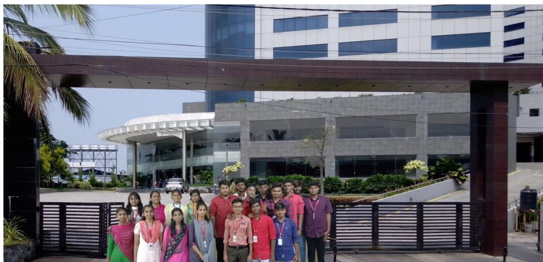
II CSE students in Nestsoft Technologies