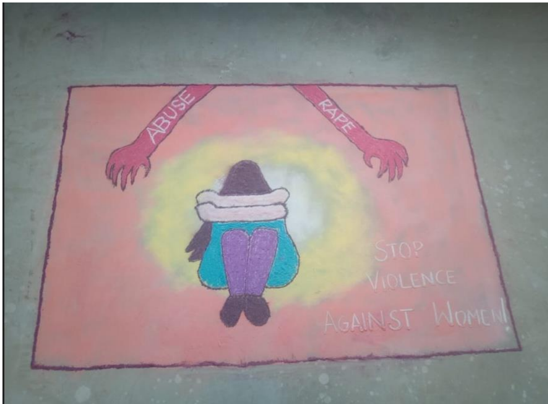
Off stage event