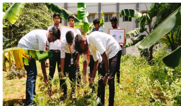
Snapshot of the Mass Campus Cleaning campaign