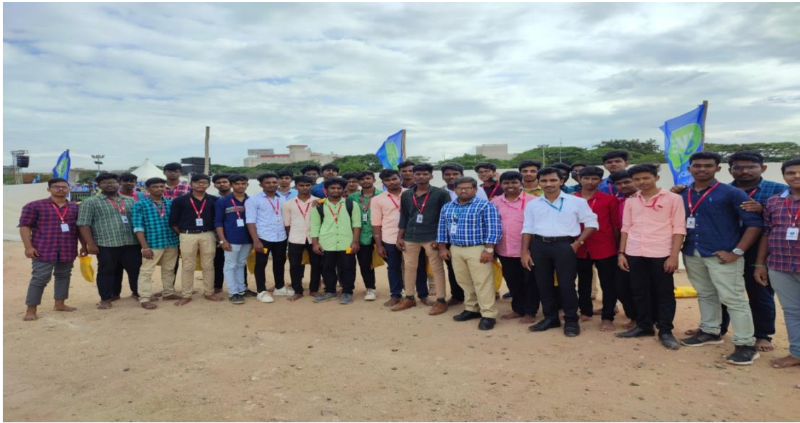
Snapshot of School Yoga day

KIT – Social Activity Club (UBA, RRC, YRC) participate international yoga day-2022 celebrations conducted by easayoga foundation on 21.6.22 at 3pm in codissia hall.