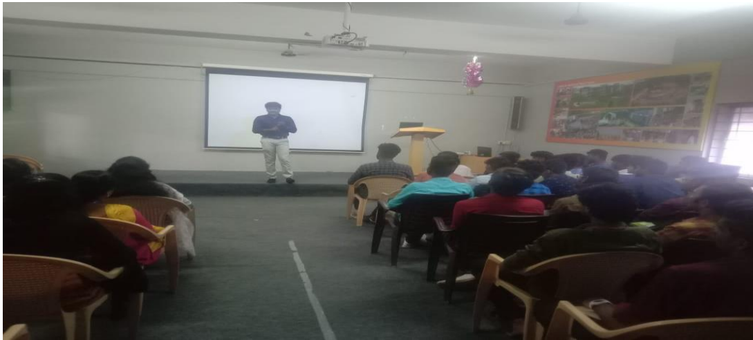
Resource person sharing about Software development models

CSE Department conducted the workshop on “Innovative Technologies in Software Development Models” on 23.04.2022.