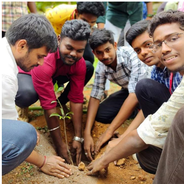
Students plant samplings