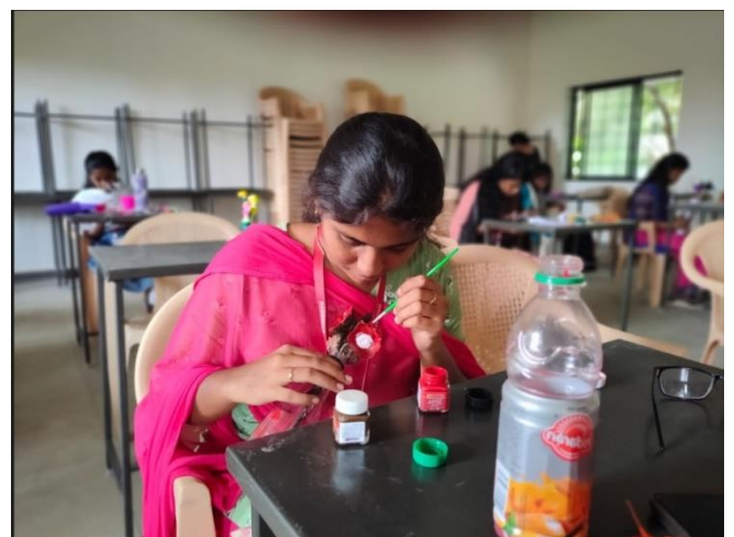
Off stage event