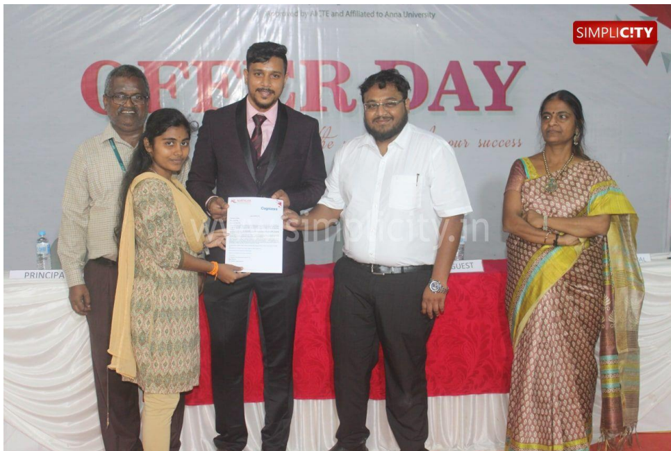
Snapshot of offer day

Karpagam Institute of Technology's Placement and Career Guidance Cell conducts Offer Day for Class of 2022 on May 28, 2022.