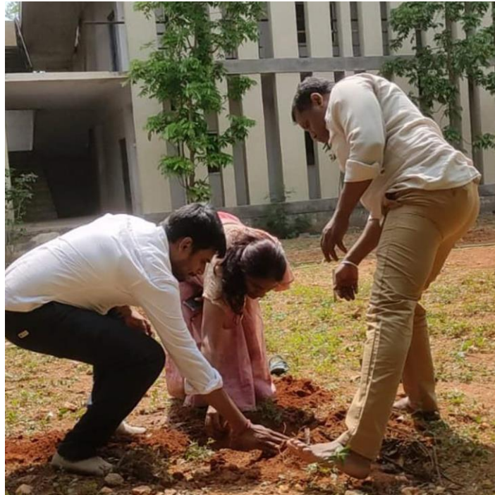
Chief guest plant samplings

Karpagam Institute of Technology's ECO CLUB has celebrated World Earth Day by planting Traditional Trees and Plants on the 22 nd of April .