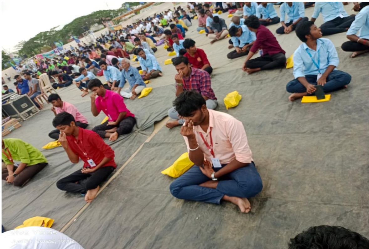
Snapshot of School Yoga day