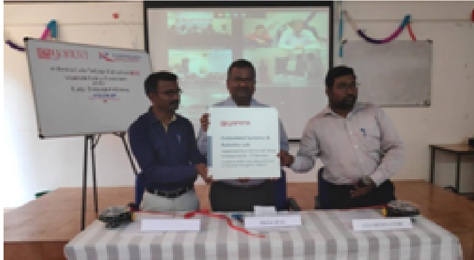
Snapshot of e-yantra