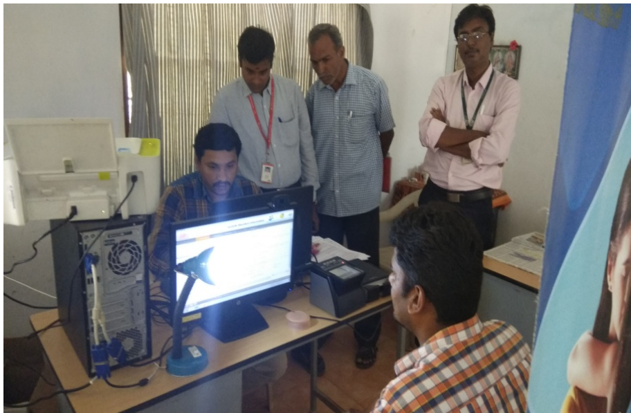
Snapshot of the activity

Lakshmi Vilas Bank, Eachnari branch, Coimbatore and NSS club of our college conducted Aadhar Camp on 26.02.2019 and 27.02.2019(both days)