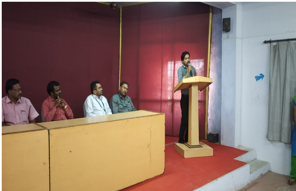
Inauguration function – Innovation Hub Club